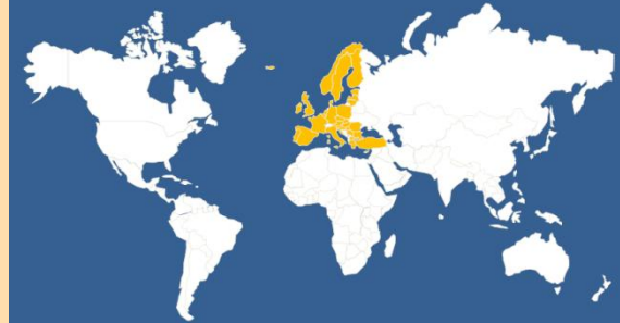
Erasmus+ Partner Countries